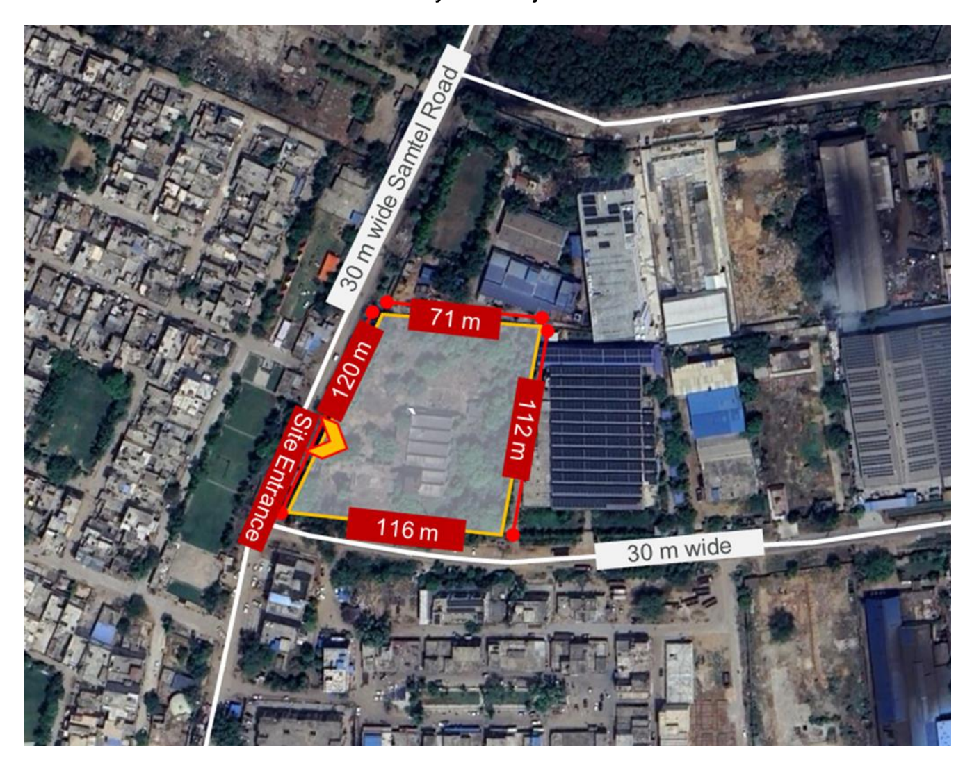
ANNEXURE 1: Layout of Project Site